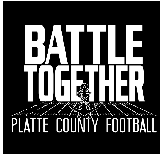
(back of shirt)